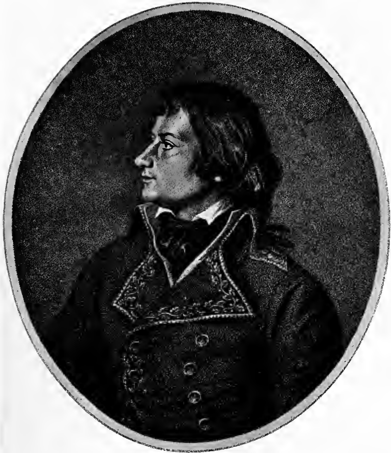
GOUVION ST. CYR, COUNT

FROM AN ENGRAVING AFTER THE PAINTING BY J. GUERIN